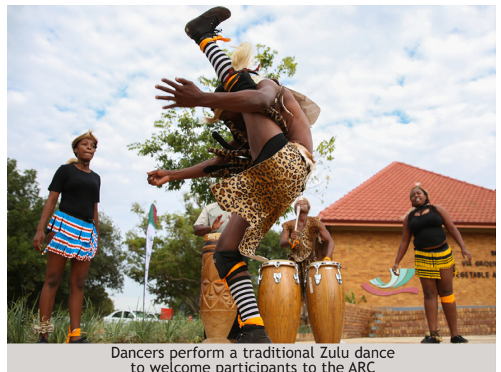
Dancers perform a traditional Zulu dance to welcome participants to the ARC

Final Messages: In her report-back of the thematic discussions, El-Kaffass described how the session had begun with seven potential collective actions, but that participants had eventually agreed to work on a single action in recognition of the complementarity of their approaches. Highlighting that many regions will be covered by the agreed upon 'Alliance for Reappropriating Rural Futures,' she expressed confidence that collaborative actions would begin within the next three months, and that the platform will help shape stakeholders' work in coming years.