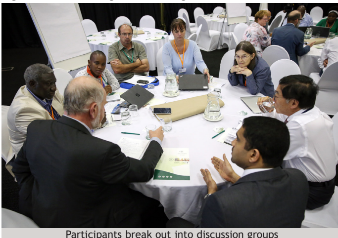
Participants break out into discussion groups

The opening round of Catalyst presentations outlined three perspectives for science including: the CGIAR integration effort, its new platform and focus area; an African agrarian philosophy that is built upon moral ethics, creativity and innovation to prioritize small-scale producers and nurture 'agripreneurs' and 'agripreneurship'; and the use of decision analysis to prioritize research for development impact.