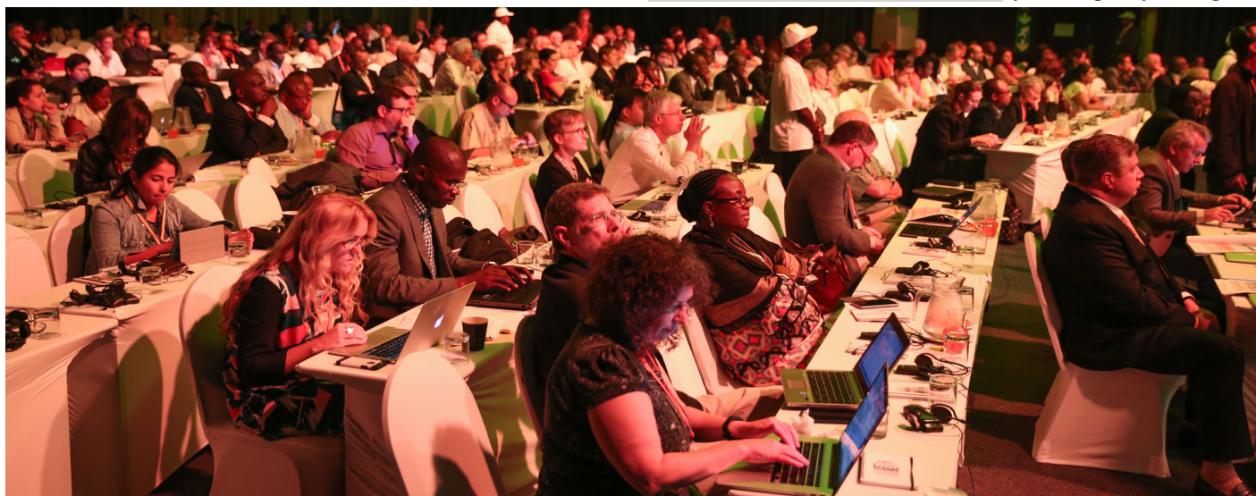
Delegates gather for the morning plenary

Development (YPARD) Philippines, proposed a bottom-up and top-down approach to tackle the low involvement of youth in agriculture, focusing on: demonstrating agricultural opportunities in rural areas; building youth capacity through