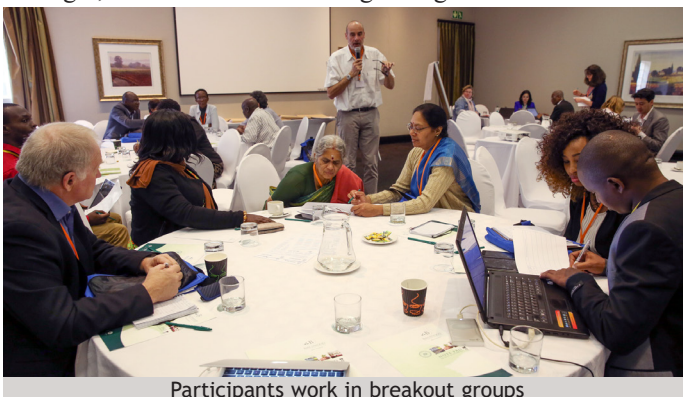
Participants work in breakout groups

During a question and answer session, participants raised the importance of mapping stakeholders for foresight action. They highlighted the particular importance of accounting for marginalized groups in foresight activities, and using local languages. It was decided that since the Catalysts addressed many complementary issues, participants would be divided into two roundtables, one addressing the grassroots level of foresight, and the other addressing its regional dimension.