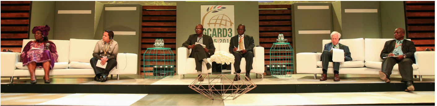
Presenters of theme: Ensuring Better Rural Futures

forme Régionale des Organisations Paysannes d'Afrique Centrale (PROPAC) highlighted that their foresight work had helped to create hope in communities that sustainable agriculture is possible. YPARD emphasized the need for young professionals to recognize the value of foresight, and the organization's use of forward thinking in the development of the YPARD Asia and Pacific Development Plan.