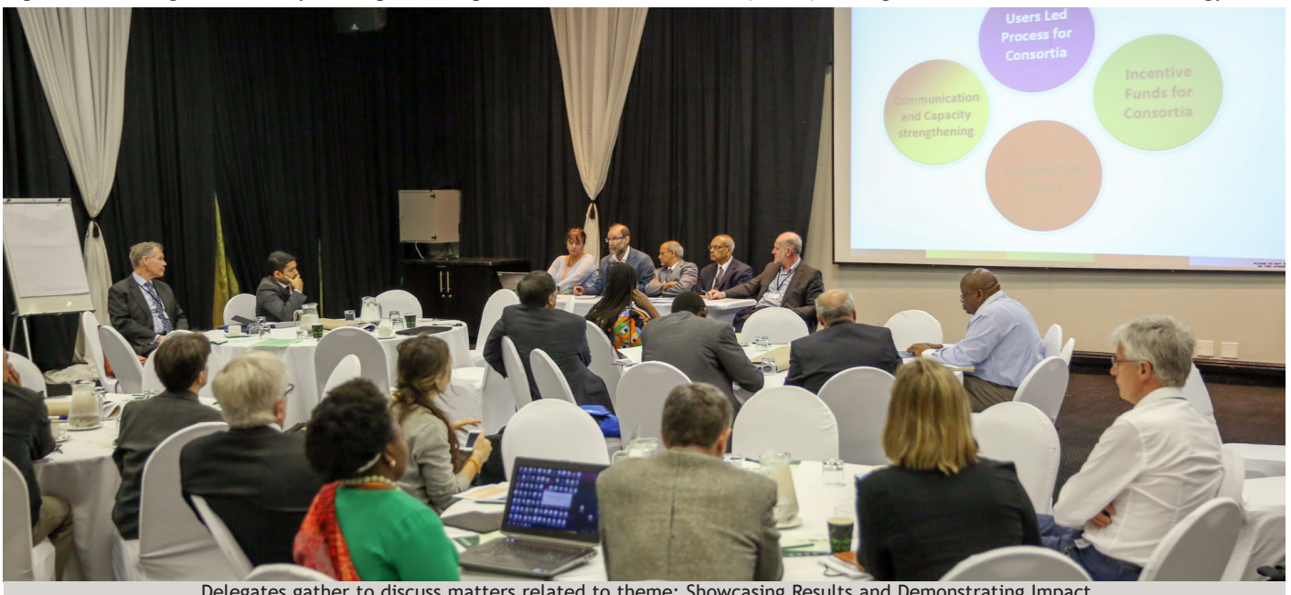
Delegates gather to discuss matters related to theme: Showcasing Results and Demonstrating Impact

During a first round of presentations, Thematic Catalysts highlighted, inter alia : the International Food Policy Research Institute (IFPRI)-led Agricultural Science and Technology