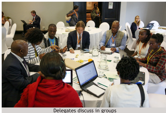
Delegates discuss in groups

During a session on broadening access to sustainable agricultural lending and insurance, Catalysts discussed experiences from the Food and Agriculture Organization of the UN (FAO) and GFAR illustrating the importance of investing in data, information and technology to support both financial services providers as well as small agribusinesses and build profitable and inclusive value chains. They highlighted the importance of factoring in the cost, as well as asymmetries of data and information flows in order to strengthen the position of farmers in value chains.