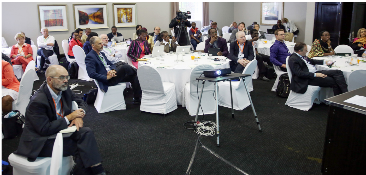
Delegates gather to discuss matters related to theme: Keeping Science Relevant and Future-Focused

In a panel session focusing on challenges, the Thematic Catalysts from Regional Universities Forum for Capacity Building in Agriculture, the Association of Public and Land-grant Universities, IWMI, AGRINATURA and Global Confederation of Higher Education Associations for the Agricultural and Life Sciences discussed the need for: strengthening infrastructure, resources and institutions in Africa; harnessing the youth potential; narrowing the gap between research and training; strengthening partnerships between the CGIAR and universities; aligning research and educational priorities; attracting and retaining more students in the agricultural research field; ensuring capacity within new generations to address complex development challenges; and tailoring science to development.