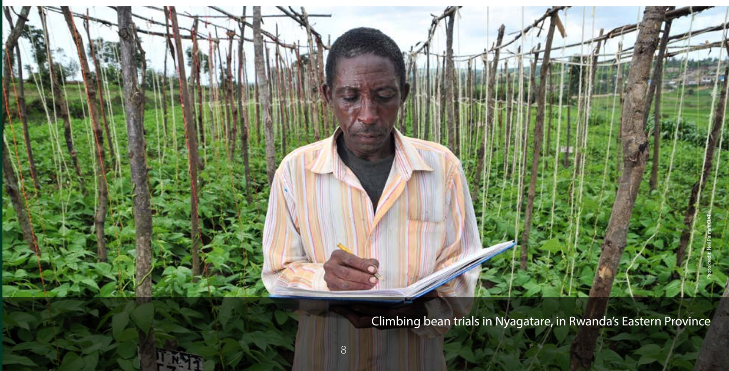
Climbing bean trials in Nyagatare, in Rwanda's Eastern Province

and in the realm of social organization and interaction. Through improved capacity to innovate, stakeholders can select, combine and strengthen specific options, which eventually results in coherent combinations of "hardware" or technical innovations, "orgware" or social innovations, and "software" or adapted mindsets. New orgware may include changes in policy, market organization, legal frameworks, service provision and incentive systems that are necessary to enable people to make use of new ideas and technical opportunities. From a systems perspective, creating these enabling conditions for technology to work needs to be seen as part and parcel of the innovation challenge. Developing successful combinations in one site makes it easier to scale the technology to another. These new combinations will in time result in the realization of other intermediate development outcomes and eventually system-level outcomes. Given the many constraints affecting the countries in which we work, and the fact that system innovations have a time horizon of at least 10 years even under favorable conditions, we are talking about a long-term process.