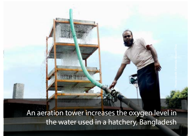
An aeration tower increases the oxygen level in the water used in a hatchery, Bangladesh

Another strategy is to employ participatory methodologies for more generic reflection on the functioning of innovation support systems and interaction patterns with relevant stakeholders, such as the Rapid Appraisal of Agricultural Knowledge Systems, or RAAKS, methodology. Such approaches provide a model of learning and inquiry that specifically aims at diagnosing crosscutting problems in specific subsectors or realms of innovation. Finally, research may study the contribution of different mechanisms, including innovation platforms, to building a system's capacity to innovate, and feed findings back into policy and practice.