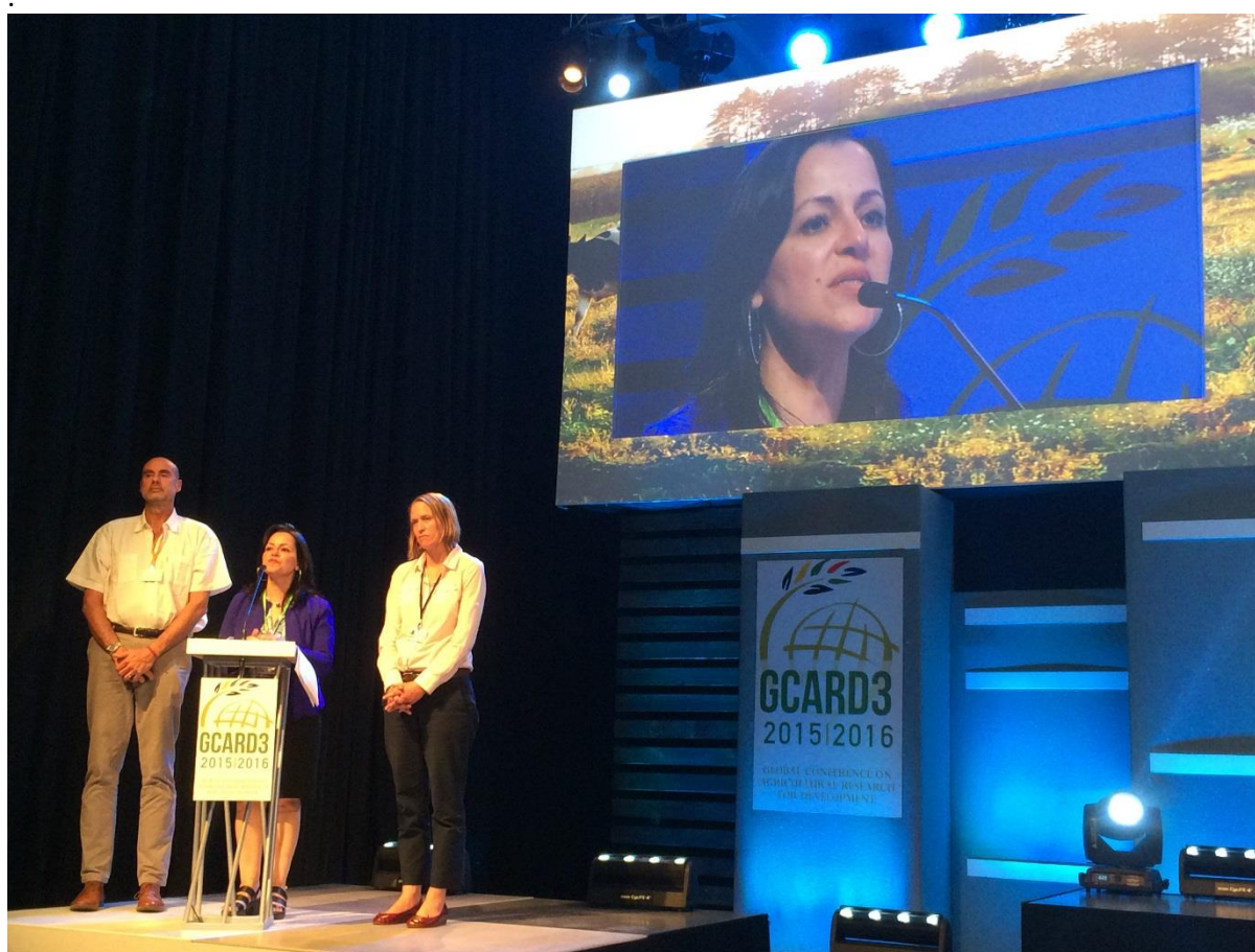
GFAR Secretariat & YPARD session facilitators set out the aims of the new Alliance at GCARD3

In GCARD3 2016, Foresight was one of the key themes explored in depth by participants. During the Conference, the Partners in GFAR, in particular farmer's organizations and regional fora from around the world, together developed the frame for a new Alliance for the re-appropriation of rural futures. The Alliance will bring together local innovation with that from science and work to bring smallholder farmers directly into the process of exploring their own desired futures, by which to inform and participate in current research and innovation processes, in order to achieve those desired futures. This Alliance has now been established into practice among a range of partners from across all sectors.