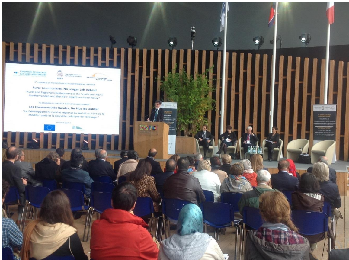
Closing plenary of the Milan Conference at EXPO 2015

GFAR Secretariat has also directly provided significant input to the governance of the CRP Dryland Systems programme, as reported under 2.1