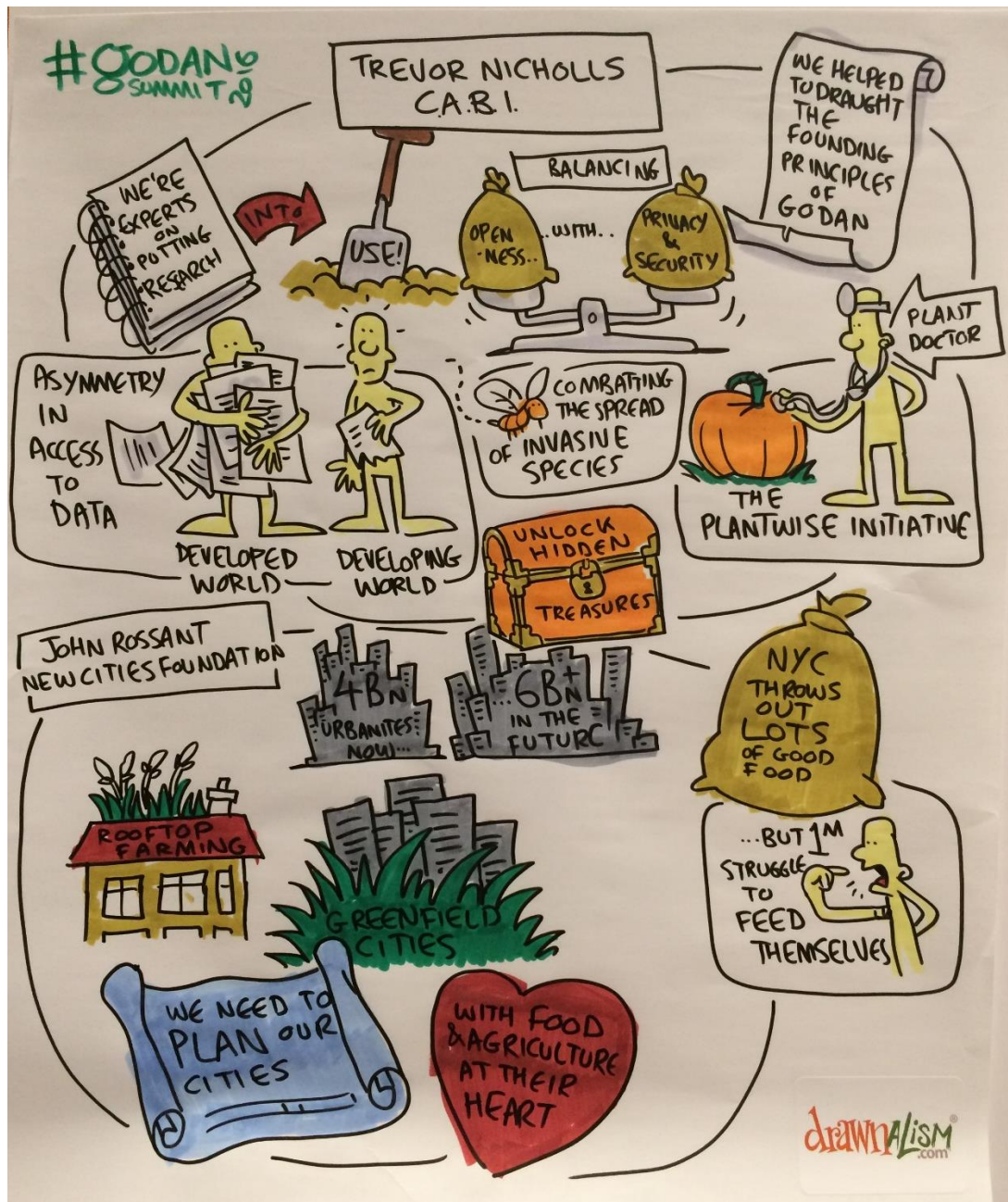
Pictorial summary of GODAN Summit discussions

GFAR Secretariat also organised and participated in Agrifutures Days International Conference organized by Club of Ossiach at Villach, Austria, including a Keynote Address on Role of ICTs in Developing Rural-Urban Continuums and Chairing the Conference session on “Role of ICTs in Sustainable Development of Rural-Urban Continuums. The Club of Ossiach is now developing proposals for E-Learning Modern Agriculture for Refugees and Migrants from Africa who have entered Europe, and also an Integrated Platform for Agricultural Information using GIS, for use in West Africa, East Africa and India.