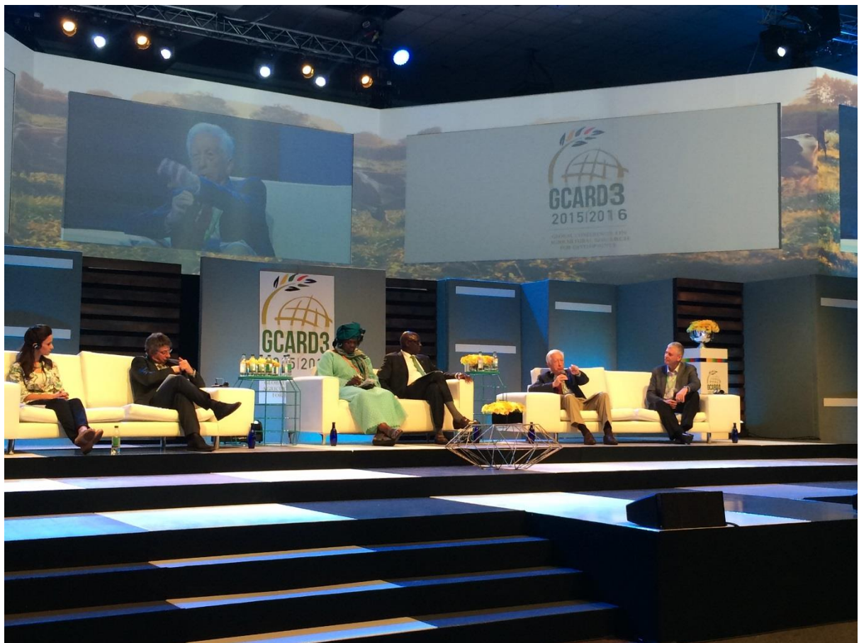
Plenary Panel Session of GCARD3, senior representatives of EC, CGIAR, IFAD, Farmers, and CSOs

The breakdown of current partners already shows an encouraging spread of active participation across all sectors. The number of self-declared Partners continues to grow rapidly. In some cases where there are strong networks, individual organizations may have so far preferred to be represented through their network organization. The term civil society organizations covers many rural development organizations at scales ranging from the community to global networks. All of the CGIAR and AIRCA Centres have expressed themselves as Partners in GFAR. Representation of the private sector is now also strong, with all the main international agriculture and food industry networks now involved, as well as many smaller companies.