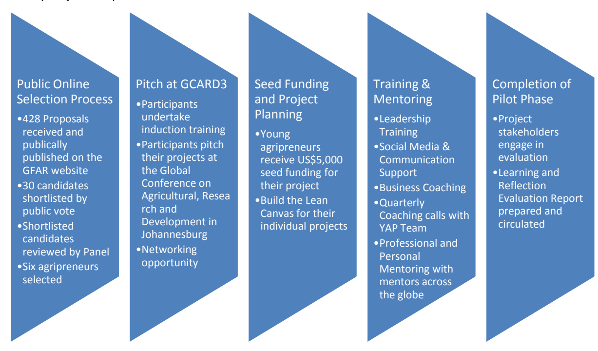
Figure 3 YAP pilot model components

This section presents the characteristic elements of the YAP pilot model and the strengths and challenges of each component identified by the young agripreneurs, Mentors, the YAP Project Team and Donors in questionnaires, YAP blog posts, and YAP quarterly meetings and interviews. Figure 3 below visually represents the key Project components.