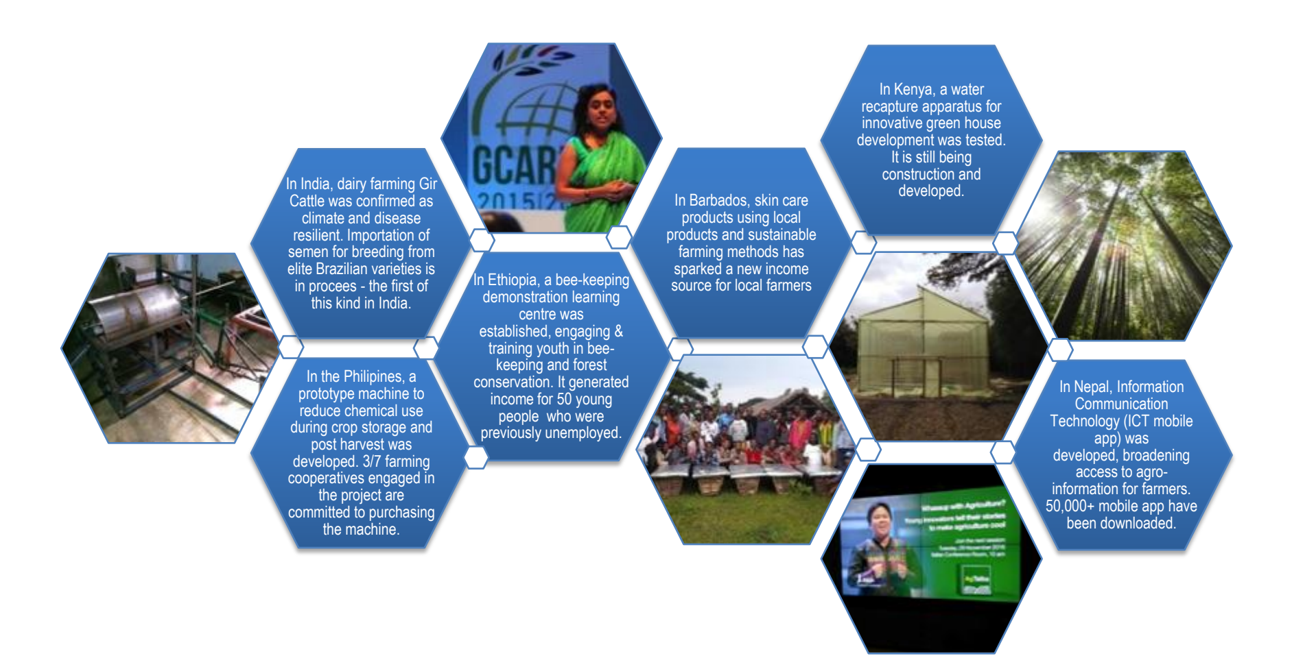
Figure 2: Snapshot of YAP Projects and their key achievements